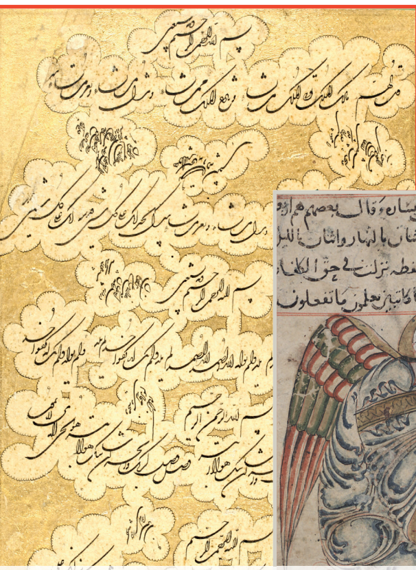
From left to right: HS. or. 2494 (SBB), Cod.arab. 464 (BSB), Ms. orient. A 462 (FBG), Ms. or. oct. 1302 (SBB), Ms. or. fol. 1708 (SBB).

We look forward to your visit at: www.qalamos.net/